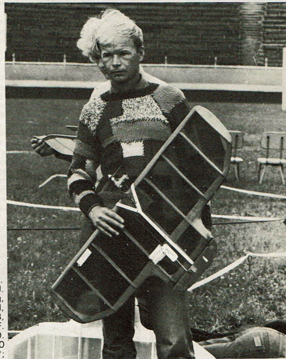
The new Combat World Champion Doroszenko of the USSR, with Solarfilm covered, balsa frame model.